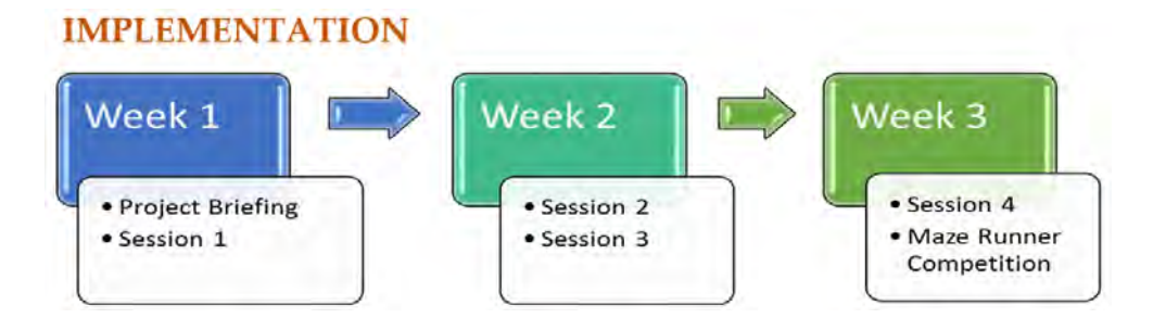
Figure 1. Contact sessions for the robotics programming project

The implementation of the Kolb model in the robotics programming project is shown in Figure 2. Four Kolb model cycles were conducted during the completion of the robotics programming tasks. Each contact session in Figure 1 represents one cycle of Kolb model implementation. In each cycle, the four stages of active experimentation, concrete experience, reflective observation and abstract conceptualisation were gone through.